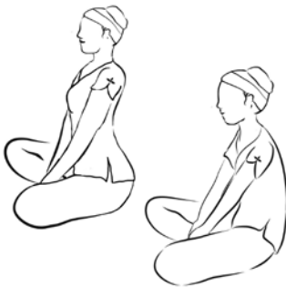
Figure KE-2a &amp; 2b